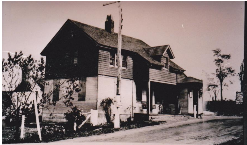
Toll House looking East