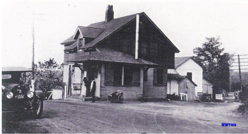
Toll House #1 Looking West